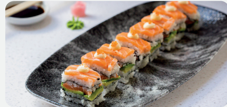
NO 6. ——— R 148 Salmon & Avo fashion Sandwich topped with salmon, kewpie mayo & caviar.