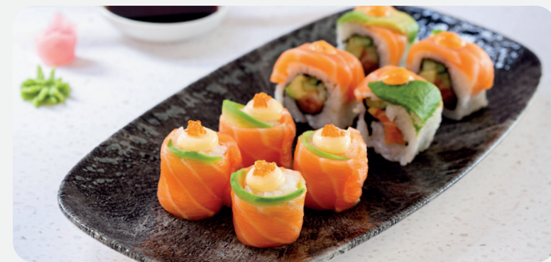
NO 5. ——— R 148 Rainbow Roll & Salmon Roses with Teriyaki Sauce & Hot Spicy Mayo