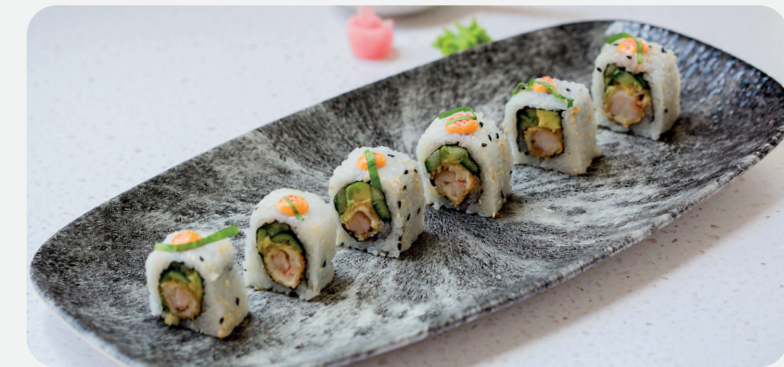
NO 3. ——— R 128 Tempura Prawn Roll & Rocket with Teriyaki Sauce & Hot Spicy Mayo