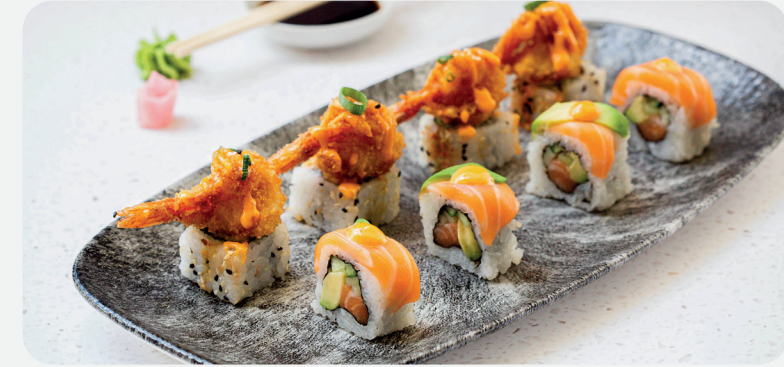
NO 1. ——— R 146 Rainbow Roll & Shrimp Tempura with Teriyaki Sauce & Hot Spicy Mayo