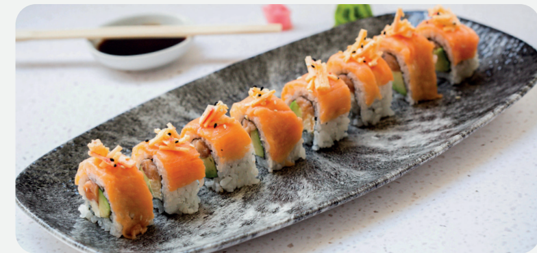
NO 2. ——— R 152 Smoked Salmon, Cream Cheese & Avo, wrapped with Smoked Salmon, topped with Crab Salad & Sesame Seeds