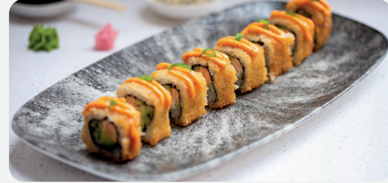
NO 4. ——— R 142 Choice of Tuna, Salmon or Veg. Crispy fantasy roll with teriyaki sauce & hot spicy mayo.